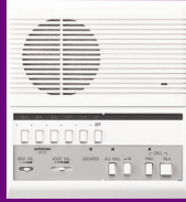
LEF-5 5-call master station.