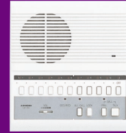
LEF-10S 10-call master station with All Call.