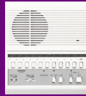
LEF-10 10-call master station.